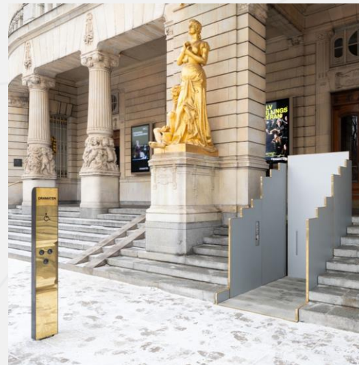
Dramaten Theatre, Sweden