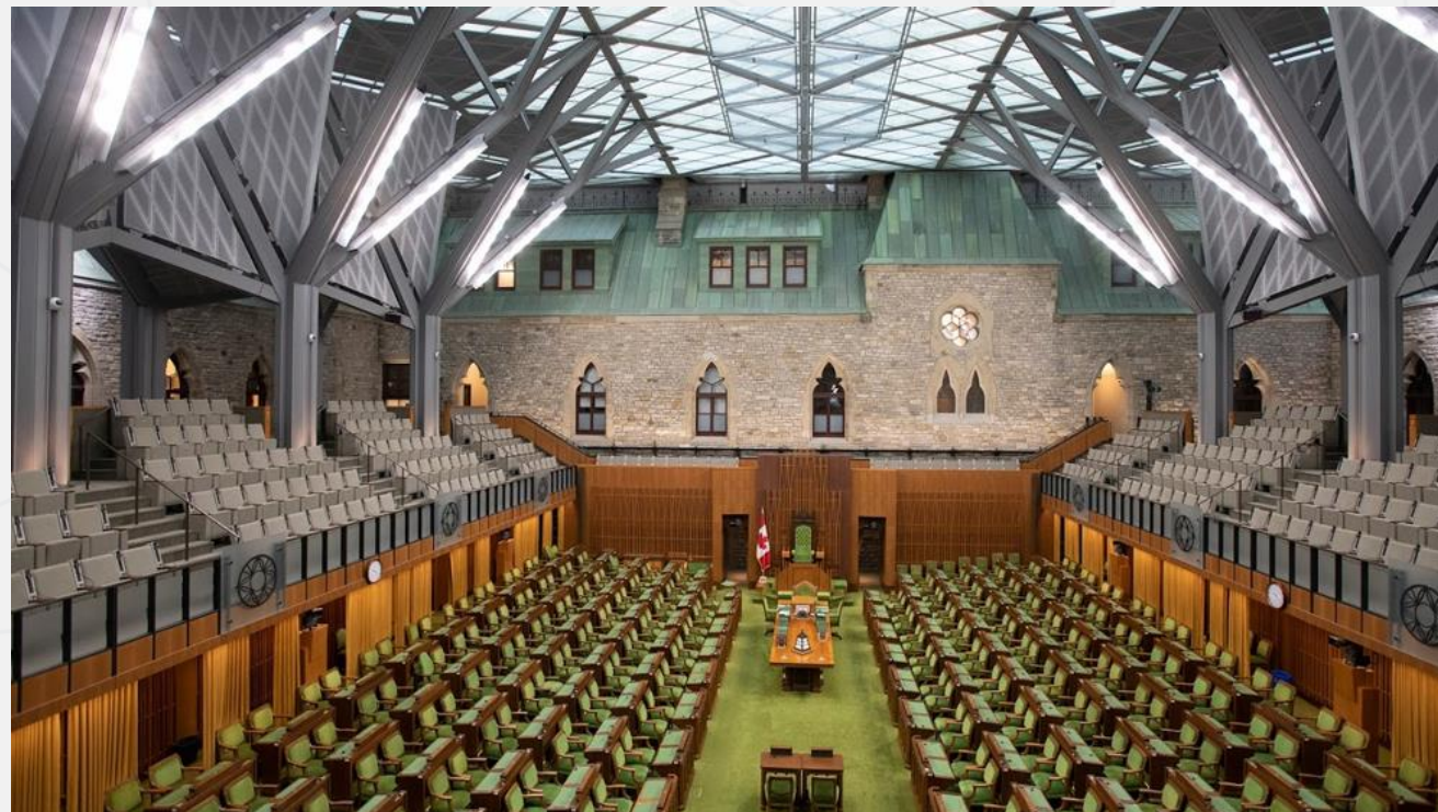
Temporary chamber in West Block