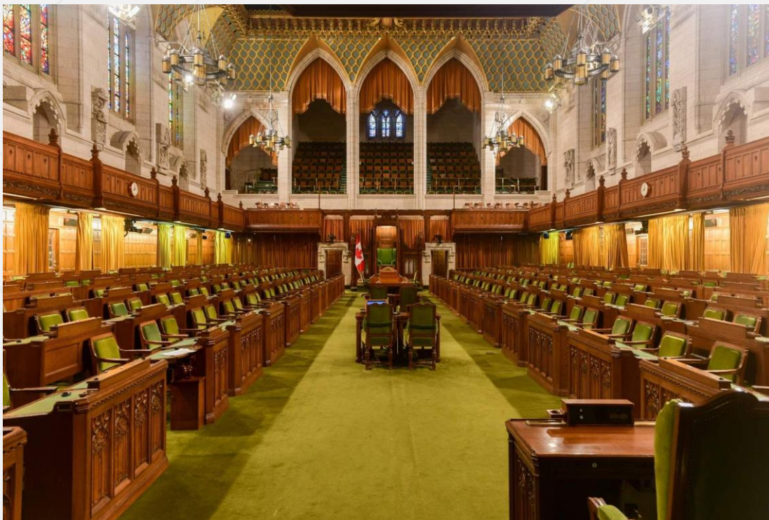
Centre Block pre-rehabilitation chamber design