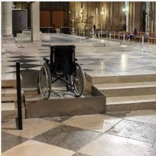
Notre Dame Cathedral, France